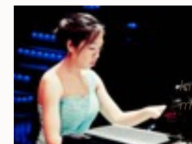
Transcribing oriental folk tunes into major stage works

The Australian Piano Duo will present a concert at St. Paul's Lutheran Church. Performing works including the Oriental Suite, Taiwanese Folk Suite and Gaverlin Sketches for Piano Duet.