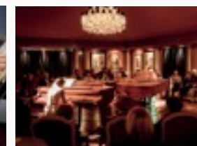
Opportunities for young musicians to perform