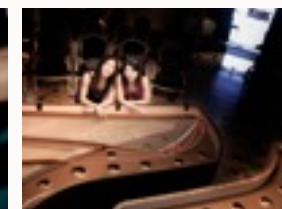
Working as a team with tips on ensemble playing